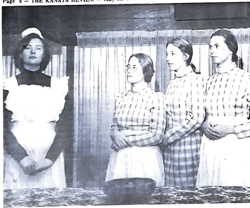
"Life with Father"